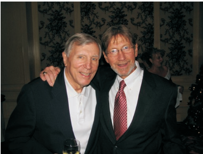
Your Heath Society president and vice-president