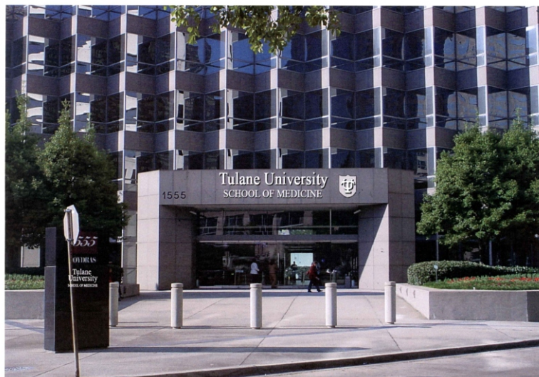
Anticipated new home of the Department on Poydras St. across from the SuperDome.

The Tulane University School of Medicine will gain from a recent, significant expansion of educational space and faculty recruitment.